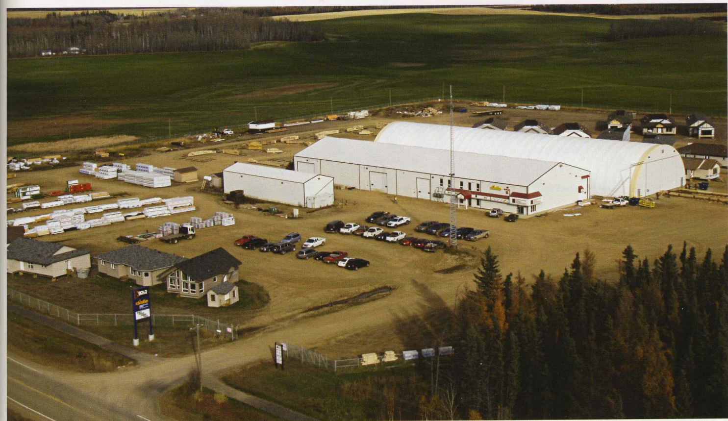
Top: Stage one of the creation of a ready-to-move home, on the production line. Bottom: Aerial view of Bold Developments.