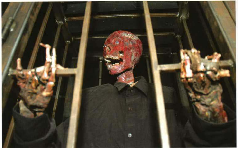
A Scream Asylum patient awaits release.