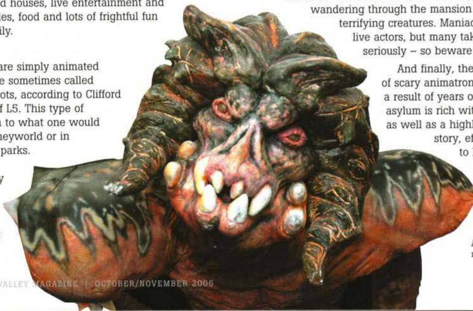
An animatronic monster.

Scream Fest is definitely one of our area's 'must-see' events during the Halloween season. "We're probably the